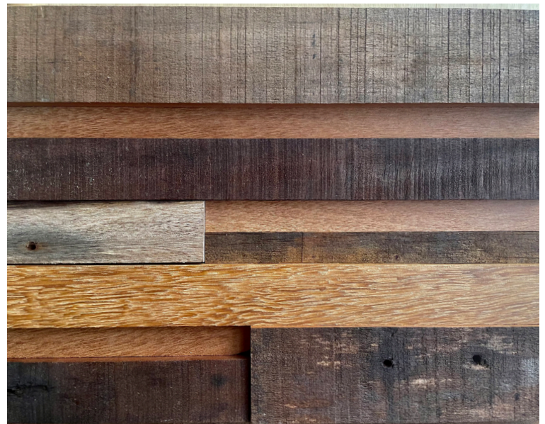
Multi-Level Tropics: Species of wood from Africa, Asia and South America

Standard Top Coat/Sheen: Satin 105 WB Finish Clear/Top Coat VOC: 213 g/l Adhesive VOC: 0 g/l