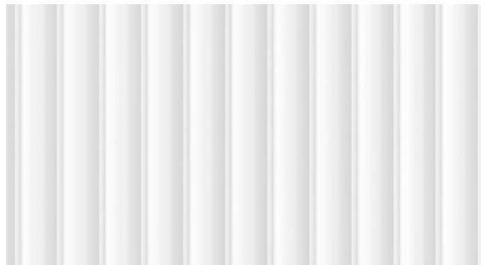
Fluted Profile: Oak, Walnut, MDF NAUF Painted

Standard Top Coat/Sheen: Matte 106 WB Finish Clear/Top Coat VOC: 213 g/l Adhesive VOC: 0 g/l Wood Filler VOC: 0 g/l