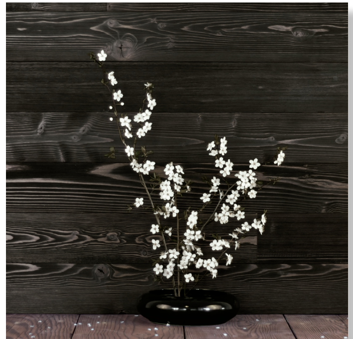
Sabi Cladding - Char