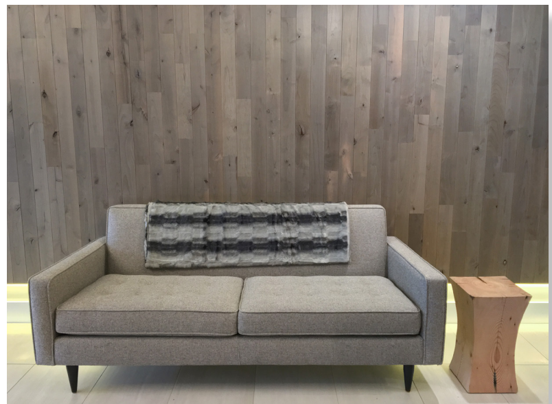
Olympia Cladding - Sage