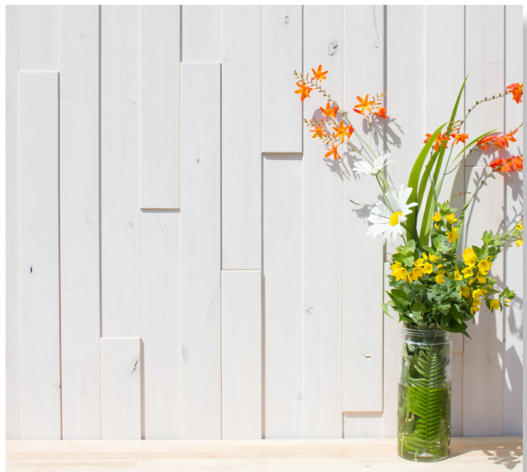
Cascades Cladding - Dove